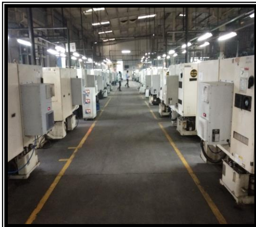
Stand Alone Unit